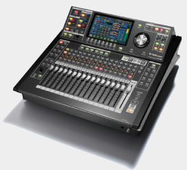
RSS M300 P1 A