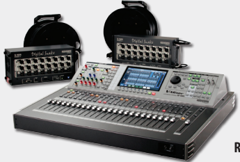
RSS M-400 V-Mixer