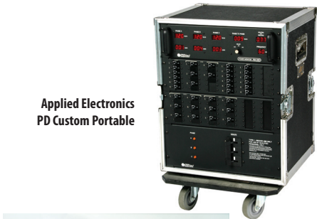
Applied Electronics PD Custom Portable