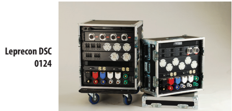
Leprecon DSC 0124