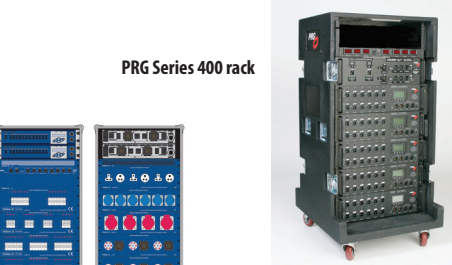
PRG Series 400 rack