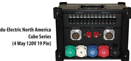
Indu-Electric North America Cube Series (4 Way 120V 19 Pin)