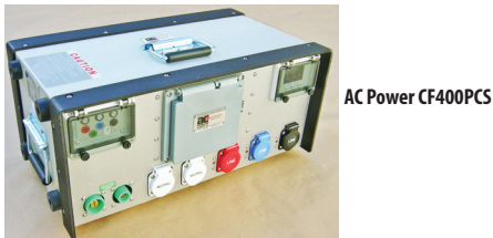
AC Power CF400PCS