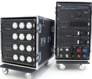
Motion Labs portable distros