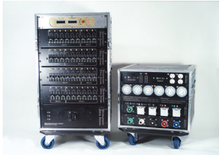
Entertainment Power Systems (EPS) racks from Creative Stage Lighting