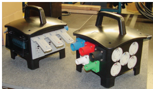
Entertainment 1 portable power distros