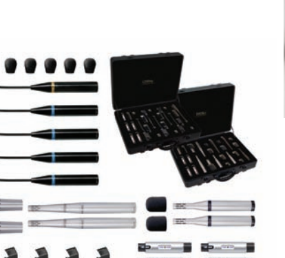
Earthworks Drum FullKit system