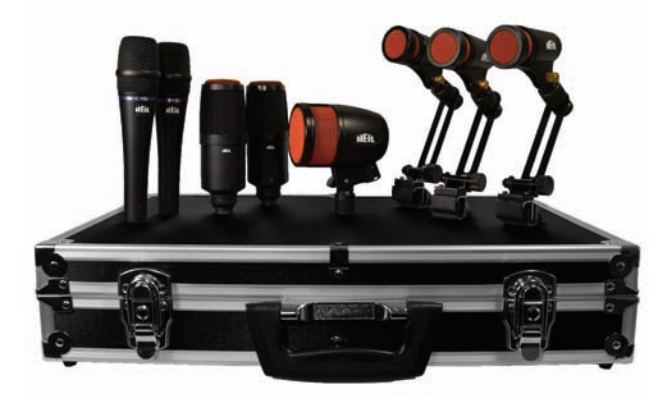
Heil HDK-8 Drum Mic Kit

Here are just some of the options you have available. F O H