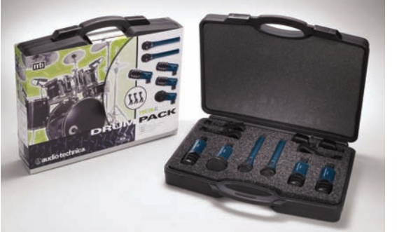
Audio Technica MB/Dk6 Drum Pack