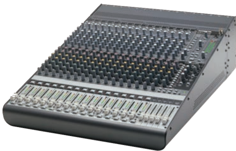
Mackie Onyx 1640