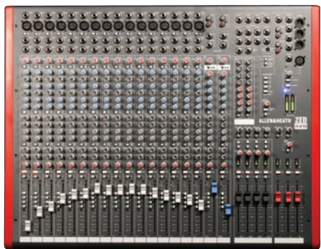
Allen & Heath ZED-420