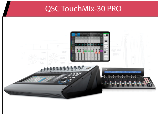
QSC TouchMix-30 PRO

Input Channels/Local Pre's: 32/24 Max Sampling Rate: 48 kHz Faders: Virtual on touch screen Onboard I/O: 24 XLR in, 6 TRS ins; 18 TRS bus outs Remote I/O: No stageboxes offered Other Frame Sizes: TouchMix-16 PRO Network Interfacing: USB, Ethernet routing to Touch-Mix Control App Footprint/Weight: 18 x 17"; 17.5 pounds Notes: Direct multi-track capture/playback