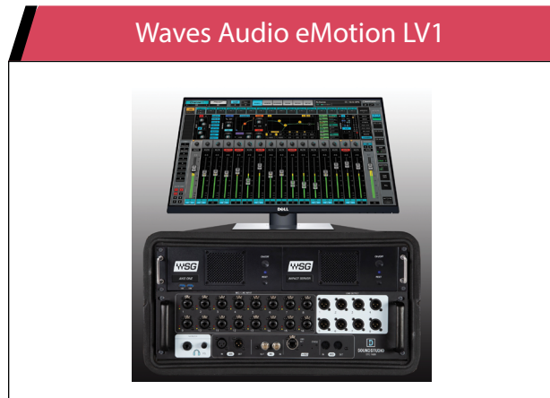
Waves Audio eMotion LV1

Input Channels: 16 to 64 mono/stereo inputs Max Sampling Rate: 96 kHz Faders: Virtual via touch screen; Platform series hardware controllers also offered Onboard I/O: SoundGrid I/Os. Remote I/O: SoundStudio STG-1608 stagebox Other Frame Sizes: Numerous Footprint/Weight: Varies by configuration Notes: Waves Audio eMotion LV1 Total Live System offers complete turnkey mixing package