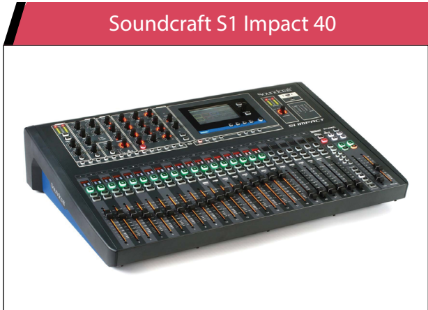
Soundcraft S1 Impact 40

Input Channels/Local Pre's: 80/32 Max Sampling Rate: 48 kHz Faders: 26 faders Onboard I/O: 32 XLR in/16 XLR out Remote I/O: Mini Stagebox 16; Mini Stagebox 32 Other Frame Sizes: No Network Interfacing: Optional MADI, CobraNet, Aviom, BLU link, RockNet and Dante Footprint/Weight: 29.5 x 20"; 44 pounds Notes: FaderGlow for ease of navigation