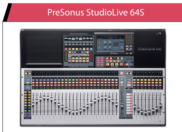
PreSonus StudioLive 64S

Input Channels/Local Pre's: 64/32 Max Sampling Rate: 48 kHz Faders: 37 faders Onboard I/O: 32 XLR in/18 XLR out Remote I/O: NSB 16.8 and NSB 8.8 stage boxes Other Frame Sizes: StudioLive 32S; StudioLive 32SC Network Interfacing: AVB Footprint/Weight: 32.4 x 23"; 37.2 pounds Notes: Active Integration with other PreSonus products