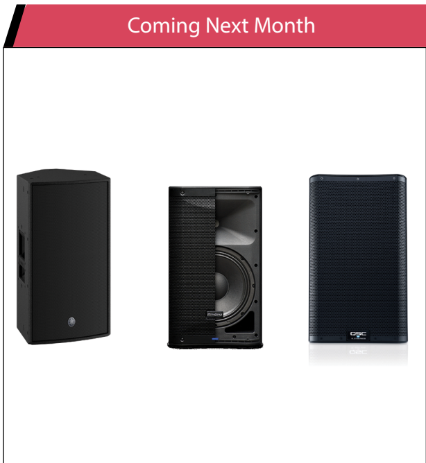
Coming Next Month