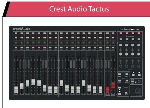
Crest Audio Tactus

Input Channels/Local Pre's: 64/8 Max Sampling Rate: 96 kHz Faders: 18 moving faders Onboard I/O: 8 line/mic ins; 8 outs Remote I/O: 32 mic/line ins; 16 outs; AES-3 outs Other Frame Sizes: Expandable Footprint/Weight: Variable per system configuration Notes: Modular system based on custom audio hardware, Tactus Mix controller and Waves Audio eMotion LV1 mix software