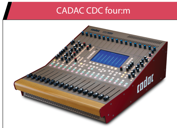
CADAC CDC four:m

Input Channels/Local Pre's: 56/16 Max Sampling Rate: 96 kHz Faders: 17 faders Onboard I/O: 16 XLR in; 3 XLR out Remote I/O: CDC I/O 3216 Other Frame Sizes: CDC-six, CDC eight-16, CDC eight-32 Network Interfacing: MADI optional Footprint/Weight: 19 x 22.5"; 33 pounds Notes: TabMix app for iPad control