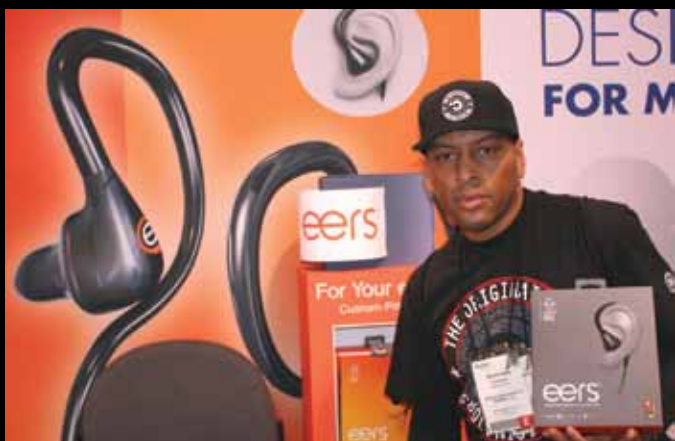
AM&S' Arabian Prince with Sonomax's Sculpted EERS instant custom-fit in-ear monitors

What follows is a sampling of this year's NAMM Show. Winter NAMM returns to Anaheim next January. This summer's NAMM takes place in Nashville July 12-14. FOH