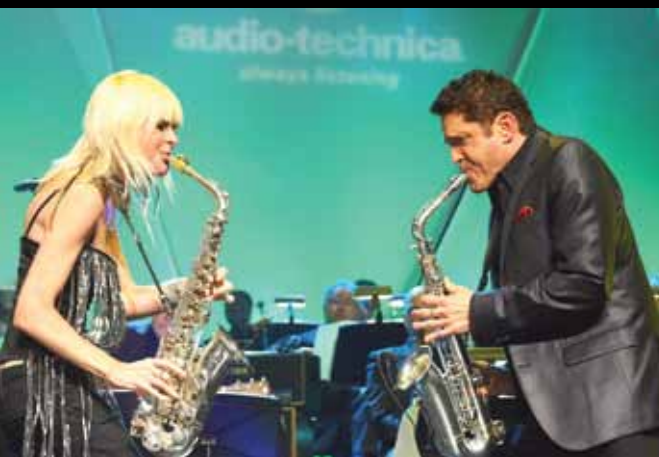
Mindi Abair and Dave Koz at Audio-Technica 50th Anniversary celebration