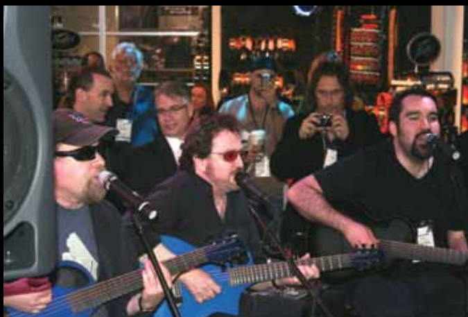
Blue Öyster Cult's Eric Bloom, Buck Dharma and Richie Castellano rock Peavey's Composite Acoustics guitars