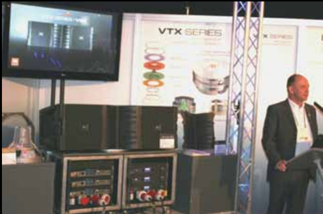
JBL's Paul Bauman introduces next generation VerTec VTX Series V25 large format line array with D2 annular ring dual HF driver