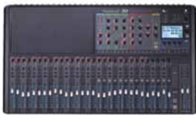
Soundcraft Si Compact 32