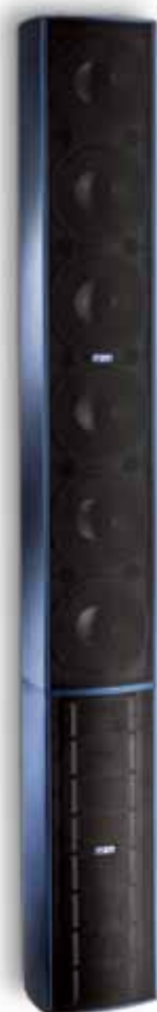
FBT Vertus MLA 2-box DSA