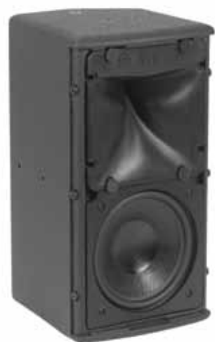
Martin Audio DD6 without grill