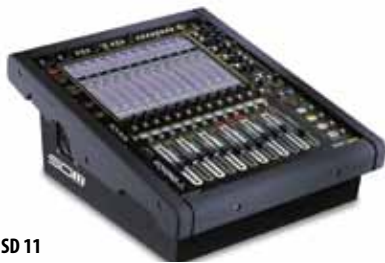
DiGiCo SD 11