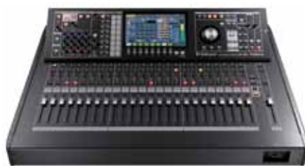
Roland M-480 mixer