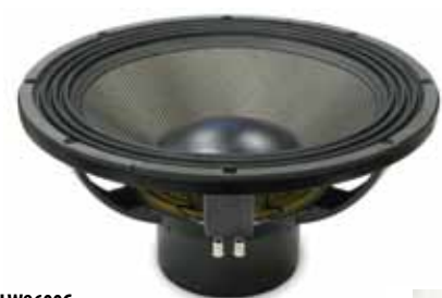
Eighteen Sound 18NLW9600C

Faital PRO introduced the 18HP1060 1200-Watt AES 18-inch woofer and its 12-inch 1kW 12HP1060 little brother, for designs that don't require their 1600-Watt 18XL1600. It has a 4-inch voice coil, an Fs of 35 Hz and 98-dB sensitivity.