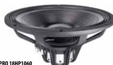
Faital PRO 18HP1060