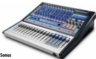
PreSonus StudioLive 16.0.2