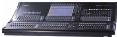
DiGiCo SD Ten

Yamaha announced their new LS9 StageMix iPad app , following last fall's release of their M7CL iPad app. It similarly allows control of input and output faders and EQ by simply connecting a WiFi access point to the console.