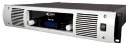
Proel C-Audio GB20

Harman Professional debuted its HiQnet Performance Manager software. It builds on the workflow paradigm introduced in System Architect 2 and is fully integrated with JBL's Line Array Calculator II loudspeaker configuration and acoustic modeling software.