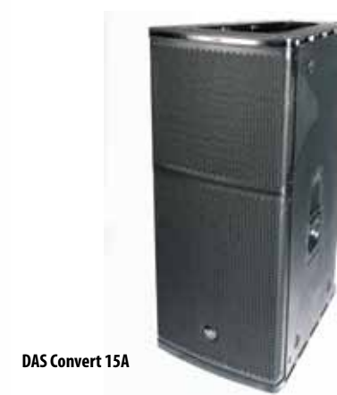
DAS Convert 15A