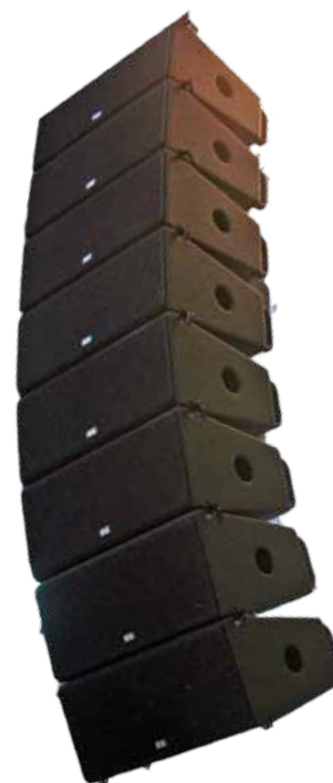
KS Audio CPD Line with AutoCurve