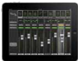
Yamaha LS9 StageMix iPad app