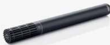
DPA 2011A modular cardioid condenser microphone