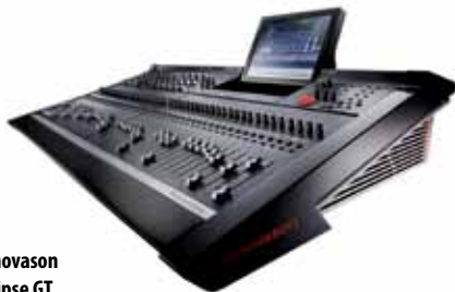
Innovason Eclipse GT